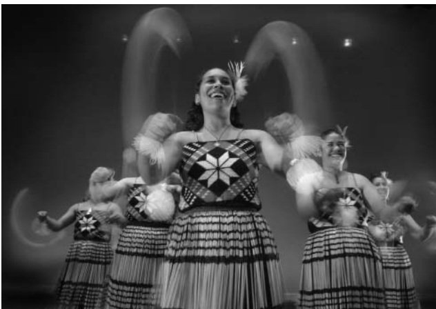
Kahurangi Maori Dance Theatre of New Zealand